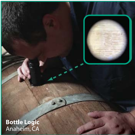
Bottle Logic Anaheim, CA