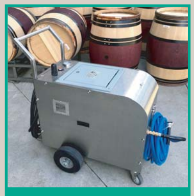
SWASH<sup>™</sup> 16901 Pressure Washer