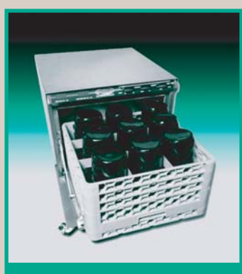
SWASH<sup>™</sup> Convertible Bottle/Stemware Washer