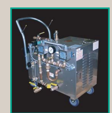
SWASH<sup>™</sup> Standard Portable Electric Steam Generator