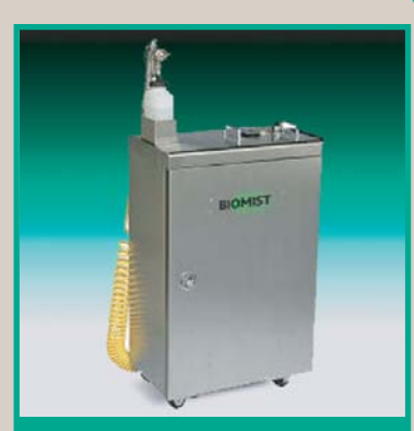
Biomist Power Sanitizing System