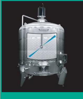
MOOG ER-55 Tank Washer