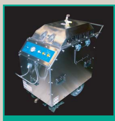
SWASH<sup>™</sup> Deluxe Portable Electric Steam Generator