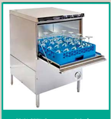
SWASH<sup>™</sup> Stemware Washer