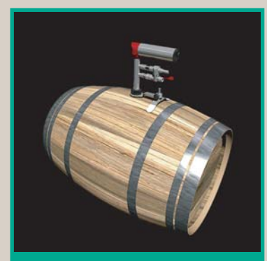
MOOG BRA Barrel Washer