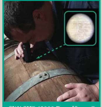
SWASH<sup>™</sup> 62000 BarrelScope<sup>™</sup> Inspection Device